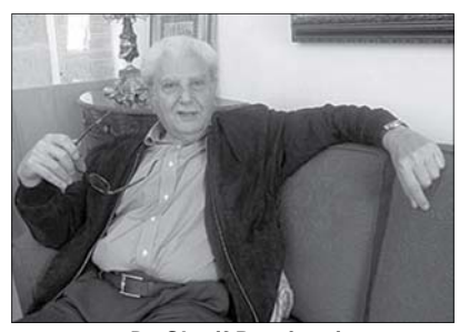
Dr. Sharif Bassiouni

The implementation of the BICI recommendations represents the core of human rights development in Bahrain and the yardstick by which Bahrain is monitored by the outside world. The recommendations were numerous, and it was known from the beginning that implementing them was going to take a reasonable amount of time. Because the report has become a point of reference locally and internationally, Bahrain has made efforts to show its seriousness in implementing these recommendations. It also sought help from countries and international institutions and continued to issue periodic reports on the