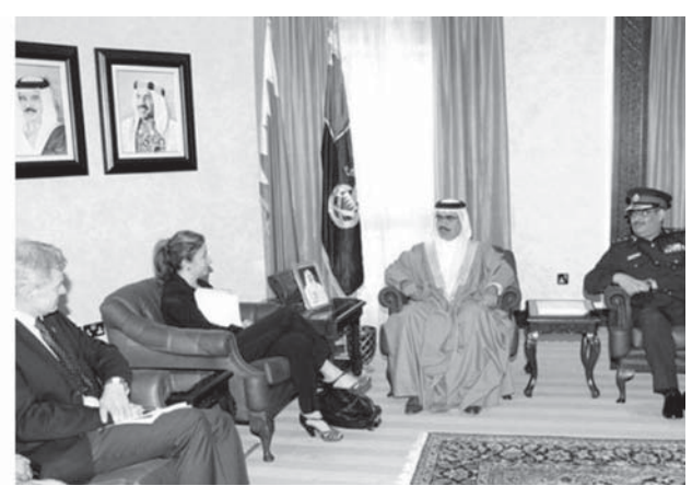
visit of HRW to Bahrain