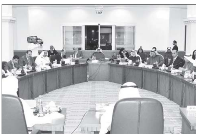
Members the National Commission during a meeting

The Commission asked the relevant authourities a number of questions as follows: how many persons were actually hired? In which governorates were they appointed? Will the recruitment be limited to community police only, or will it extend to include other security sectors? The Commission requested information on action taken and to be taken in the future. It also found that the implementation on this recommendation required a clear and