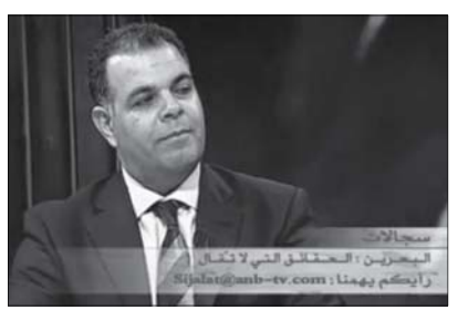
Interview with ANB