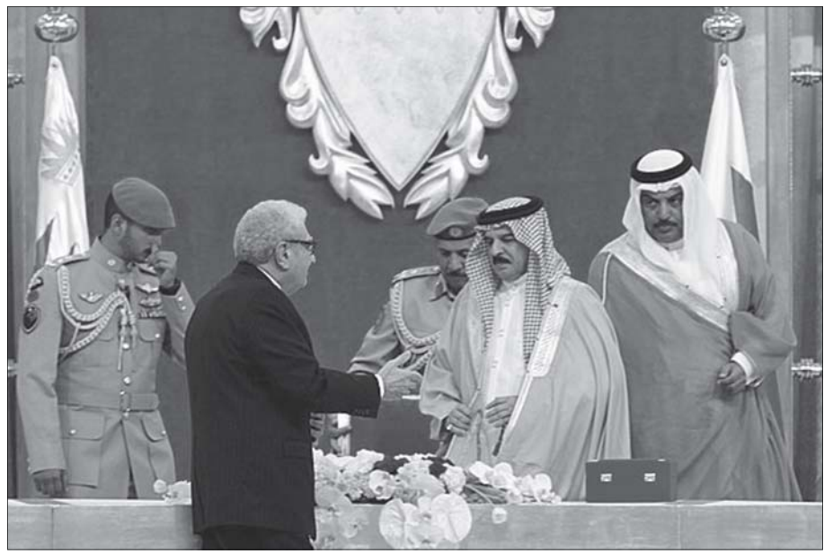
The King receives BICI report

In its first meeting, the National Commission charged with the implementation of the recommendations of the BICI Report said that the recommendations regarding the dismissed workers, the students and places of worship will be a top priority. The members of the Commission agreed to refer to the BICI to solve any disagreements and to adopt any proposal by consensus. Also during this meeting three subcommittees were established to deal with legislative issues, human rights and national reconciliation.