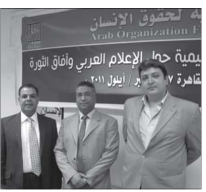
With the Secretary General and Executive General of the Arab Organisation for Human Rights