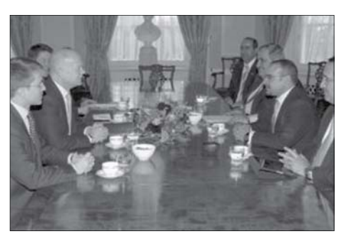
British Foreign Secretary meet HH Crown Prince in London