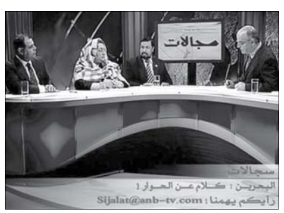
interview with ANB